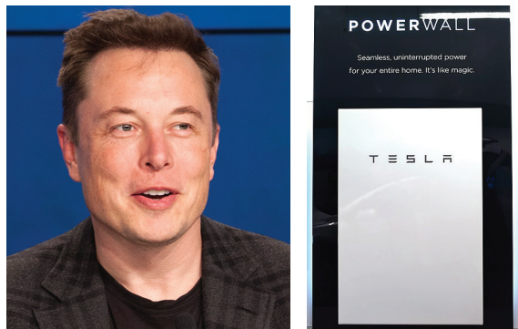
Figure 1: Elon Musk, Founder and CEO of Tesla and the Powerwall 2