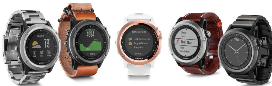
Figure 3: The Garmin Product Family